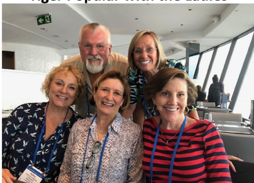
Tiger Popular with the Ladies