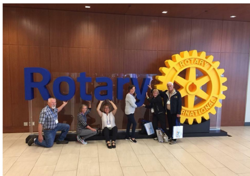
Tiger Loved and Believed in Rotary