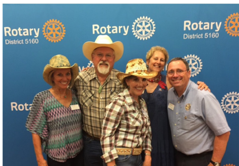
Tiger- Our Hollywood Cowboy