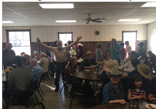
Tiger-The life of the Party