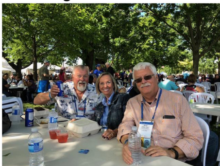
Tiger- Friend to all