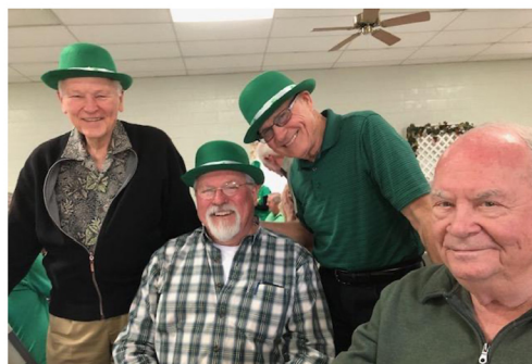
Tiger- Hanging out with some friends