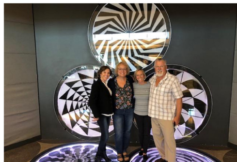
Tiger-The World Traveler