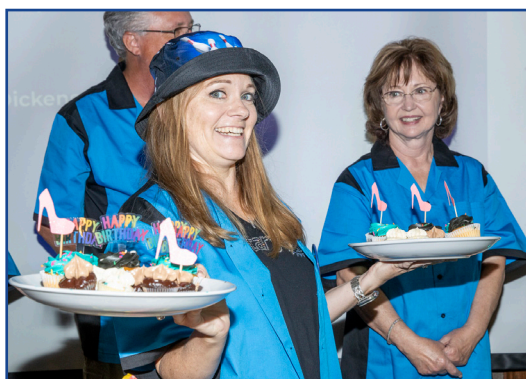
Cupcakes to celebrate the new President's birthday!